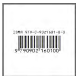
The export I sent to this publisher, in this case PDFs of the barcodes

weeks, they studied the software and created new records. After checking the correctness of the data entered with the ISMN International Agency, they started filling the database with data from the ISMN Moldova database. It proved to be a very useful software, which permitted to manage the ISMN system in every country in a better way.