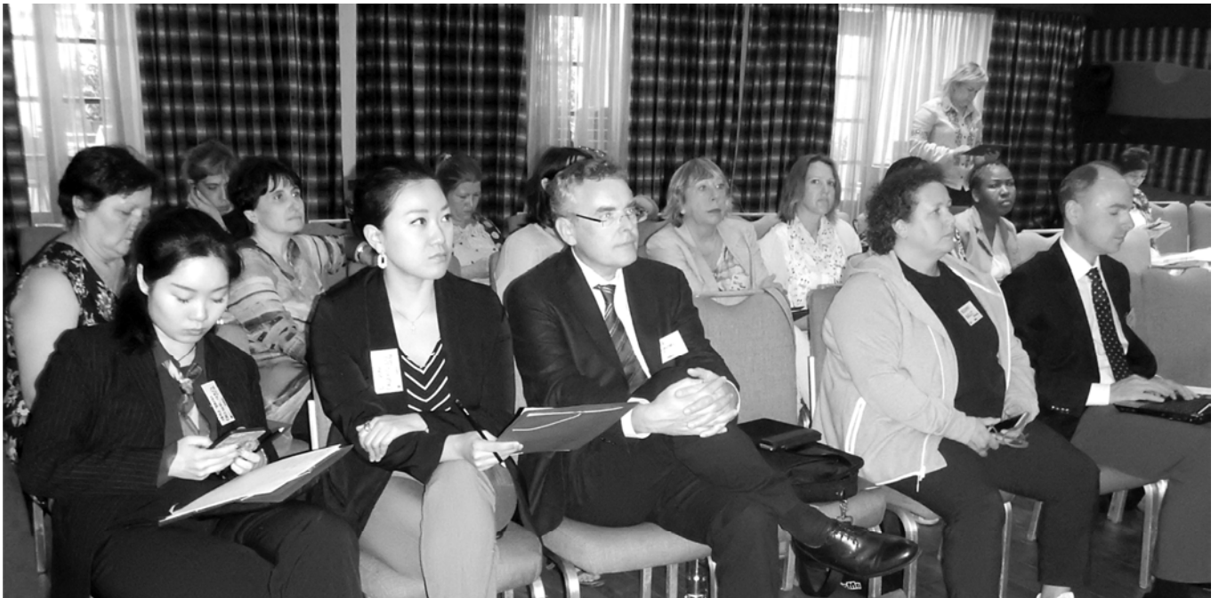
Participants of the 2018 ISMN Meeting

the ISBN instead. There was in fact a decrease in the use of ISMN. Allocating ISMNs cost staff and time and the agency's budget did not allow for promotion and marketing. She would therefore appreciate to have group discussions at the next Panel meeting to exchange ideas about improving the situation. She wished the International ISMN Agency would do a lot more promotion.