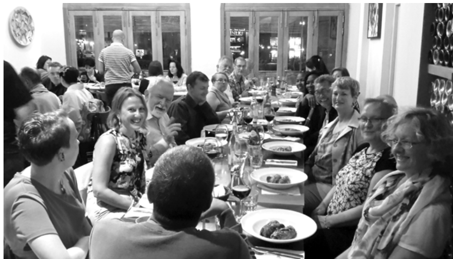
After a long day with sessions and discussions, the participants enjoyed a fabulous dinner with Maltese specialties.